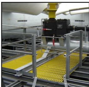
Gearbox Access Platform