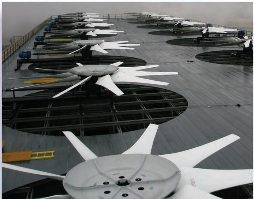
Tower under construction without fan stacks. Three foot support spacing shown.